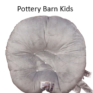
Pottery Barn Kids